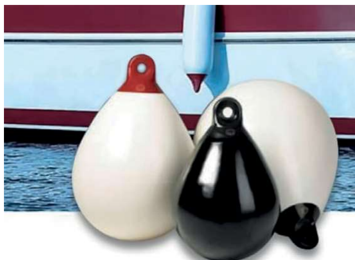
Dan-Hill-Plast develops, sells and manufactures its own products such as fenders for ships and boats under the trademark Dan-Fender, which is sold worldwide

At least once a year, the Board of Directors makes an overall assessment of risks relating to the financial reporting process. As part of the risk management, the Board of Directors considers the risk of fraud and the measures to be taken in order to reduce and/or eliminate such risks. In this connection, Management's incentive/motive, if any, for fraudulent financial reporting or other fraud is discussed.